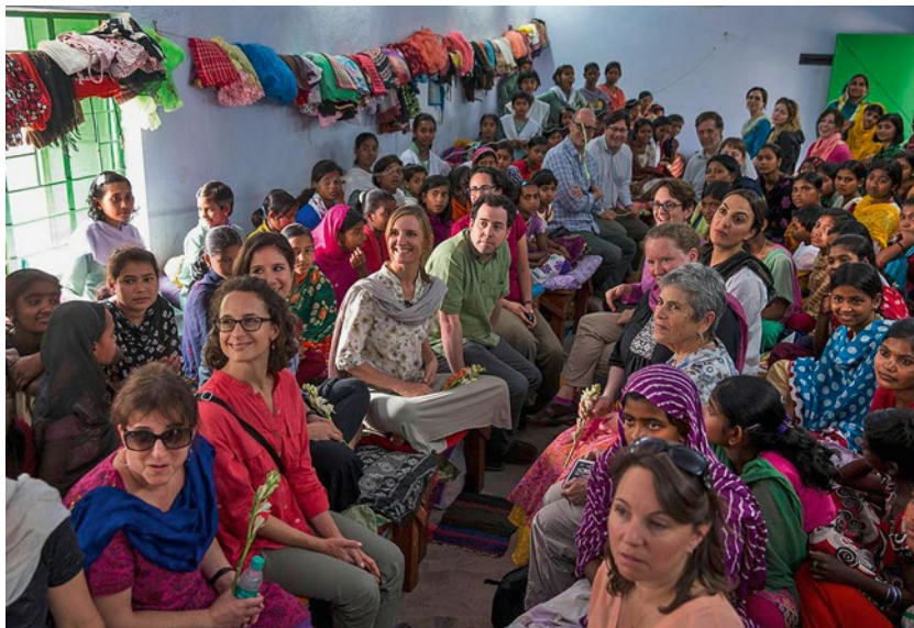
Jewish activists and community leaders in India meeting with underprivileged young women to discuss their aspirations.