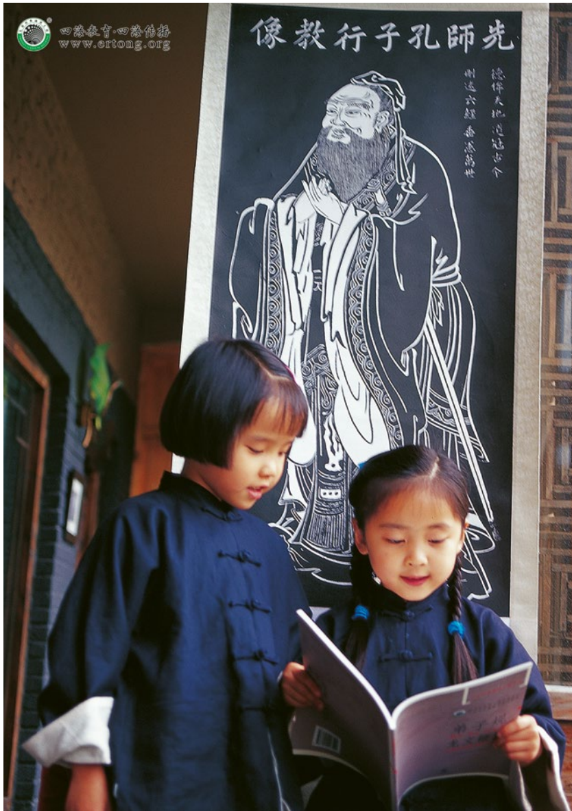
Young children in traditional costume learning Confucian values in China.